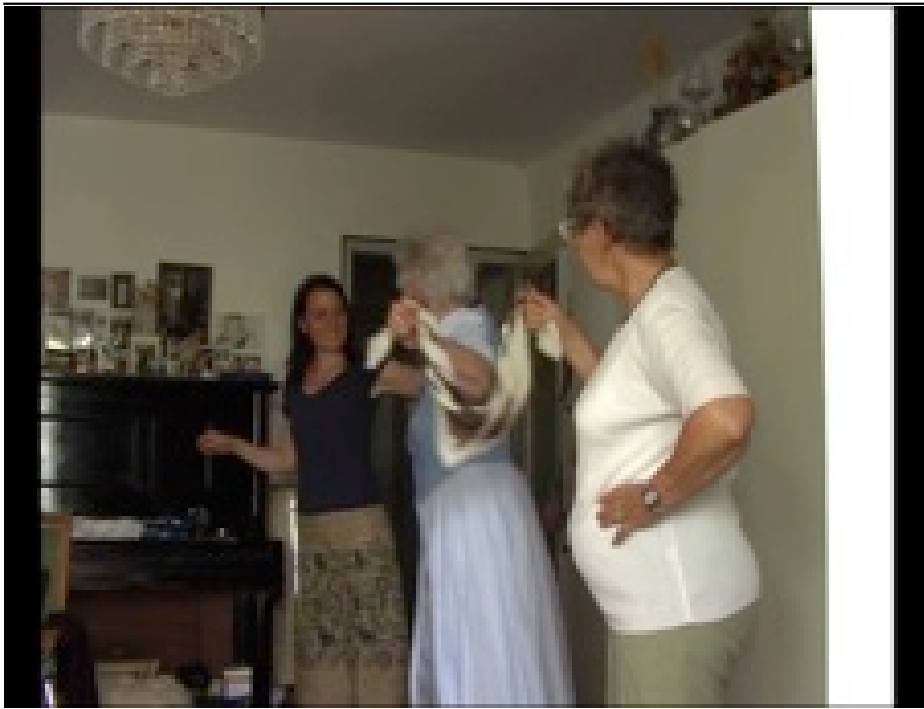
Figure 9: Sudeten Germans practice their traditions in a private setting and teach the author dances. [From video recorded on 09 June 2010 by Ulrike Präger].

Contemporary Sudeten-German identity is a hybrid construction rooted in the “old” homeland and in the shifted refugee identities in the “new” homeland. The ethnic boundaries between Sudeten Germans and Germans changed slowly but significantly after the expulsion through amalgamation—“through the union of two or more groups to form a larger unit which differs from any of the component parts” (Schramm 1979:5). Sudeten Germans are now integrated and mostly undistinguishable from the host population. They are living in what I call an “assimilated diaspora.”