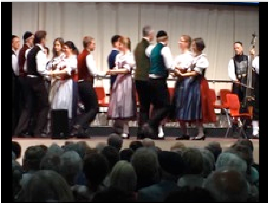
Figure 7: Annual Sudeten-German Meeting in Augsburg, 2010. Sudeten Germans dance for other Sudeten Germans on stage. Cultural practices are displayed as art objects. [From video recorded on 22 May 2010 by Ulrike Präger].