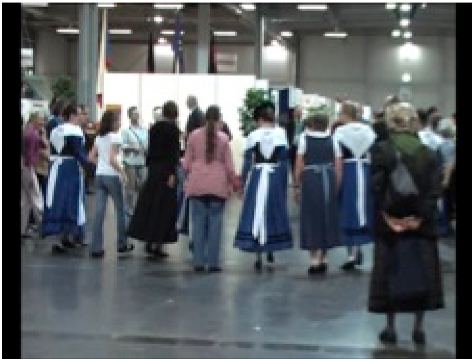
Figure 8: Sudeten-German Annual Meeting in Augsburg, 2010. Sudeten Germans sing and dance spontaneously in a different room accompanied by live music. Everyone can participate. [From video recorded on 22 May 2010 by Ulrike Präger].